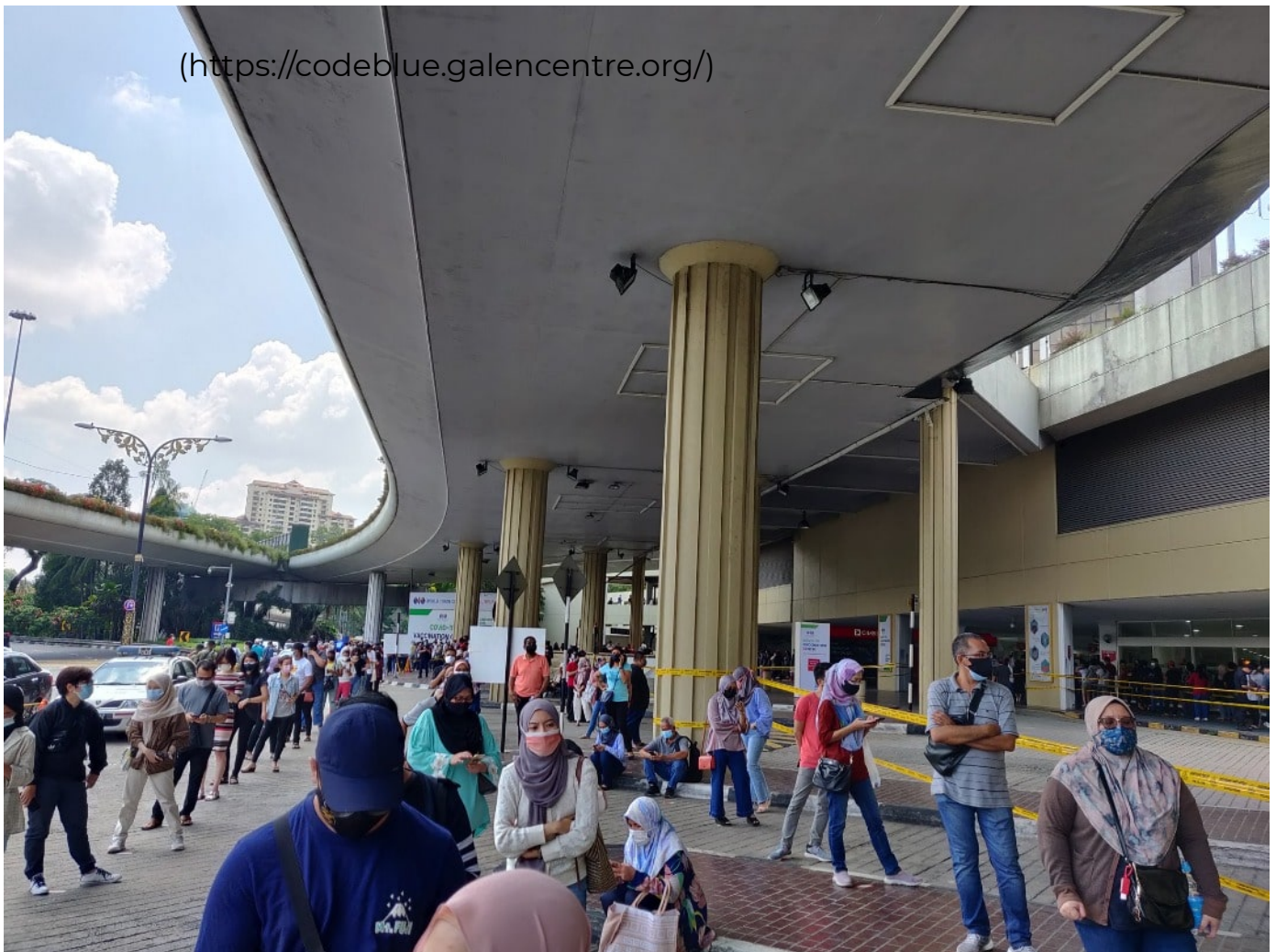
Long queues at the World Trade Centre (WTC) Kuala Lumpur Covid-19 vaccination centre on May 29, 2021.

KUALA LUMPUR, June 1 — Private general practitioners (GPs) have complained about government bureaucracy preventing them from administering Covid-19 vaccines, amid overcrowding at a mega vaccination centre (PPV) in Kuala Lumpur.